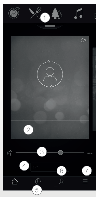
*Feature availability depends on the hearing aid model and the fitting by your hearing care professional. **Available if the Tinnitus Breaker Pro feature has been enabled by your hearing